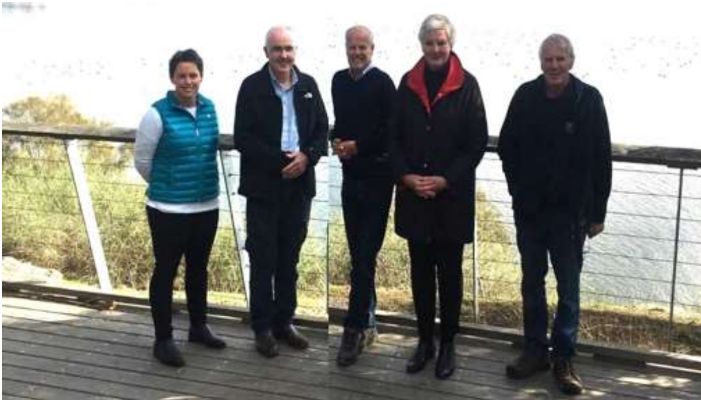
Photo: FOTB Committee Members at Lake Connewarre