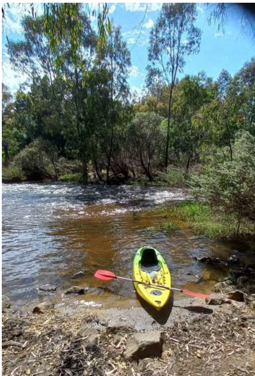
Kayaking the Barwon

Thank you to all our sponsors and supporters