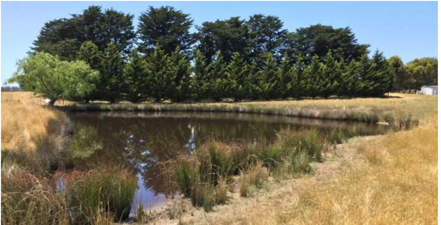
Photo: A farm dam beside the Moorabool River.