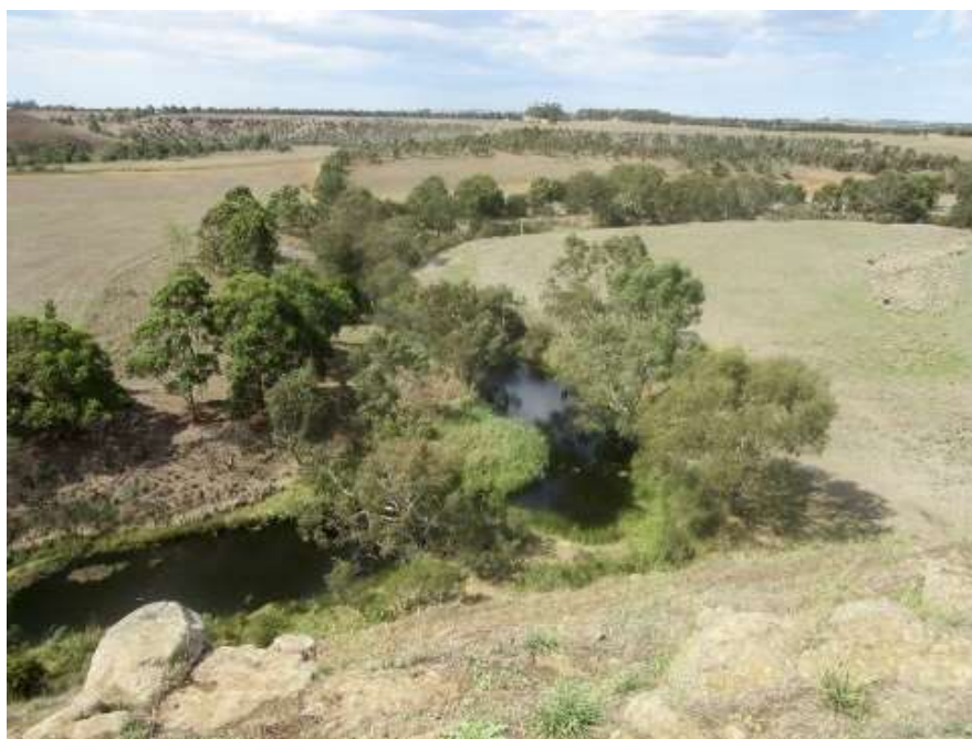
Photo: Barwon River near Inverleigh

FOTB will be informing local governments on their obligations to comply with the new controls.